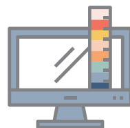
SafeDose® Digital Tape